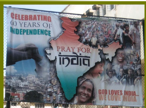
India Still Needs Independence